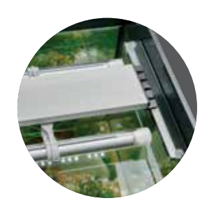
Best plant growth LED lighting in constant white daylight at 6500 Kelvin.