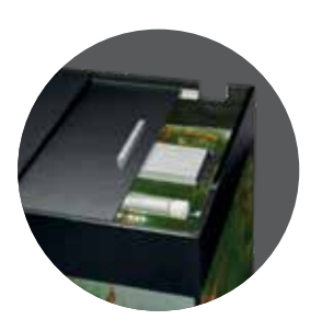
Convenient access Sliding cover made from high-quality glass.