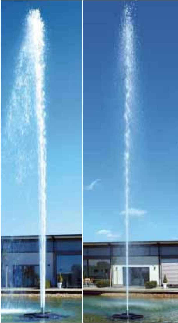
Geyser Jet 30